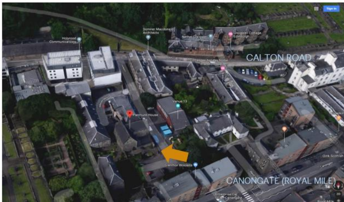
(Above) This picture was extracted from Google Maps in 2018 whilst reconstruction was underway and illustrates Panmure's location (3D satellite).