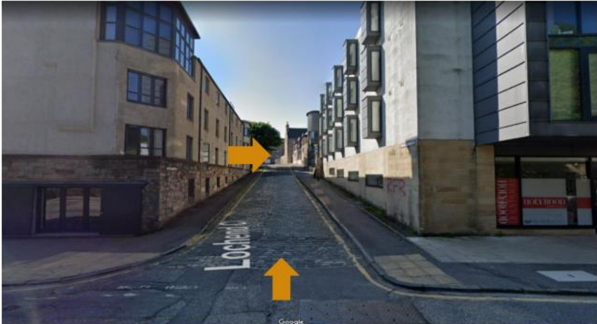
(Above) Lochend Close viewed from Calton Road. Panmure House is on the right-hand side, at the end of the street.