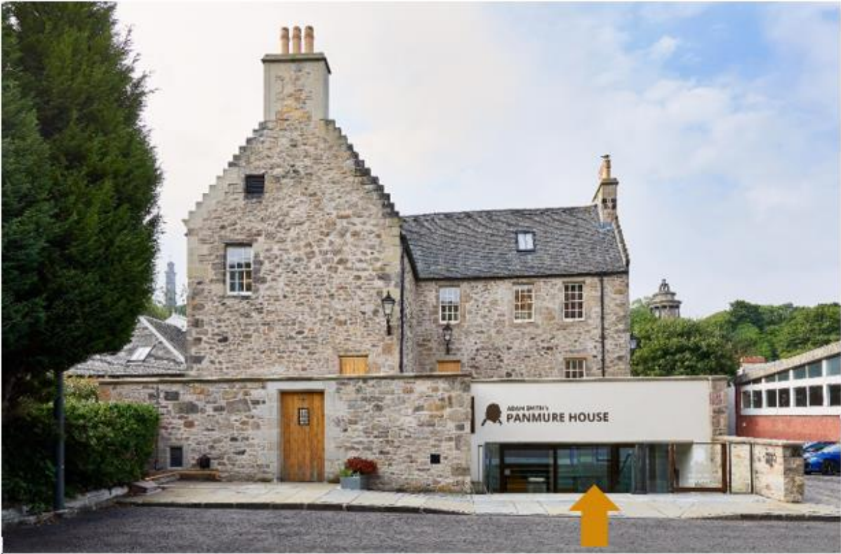
(Above) Panmure House exterior. Take the stairs down into the main entrance & ring the intercom on the left-hand side.